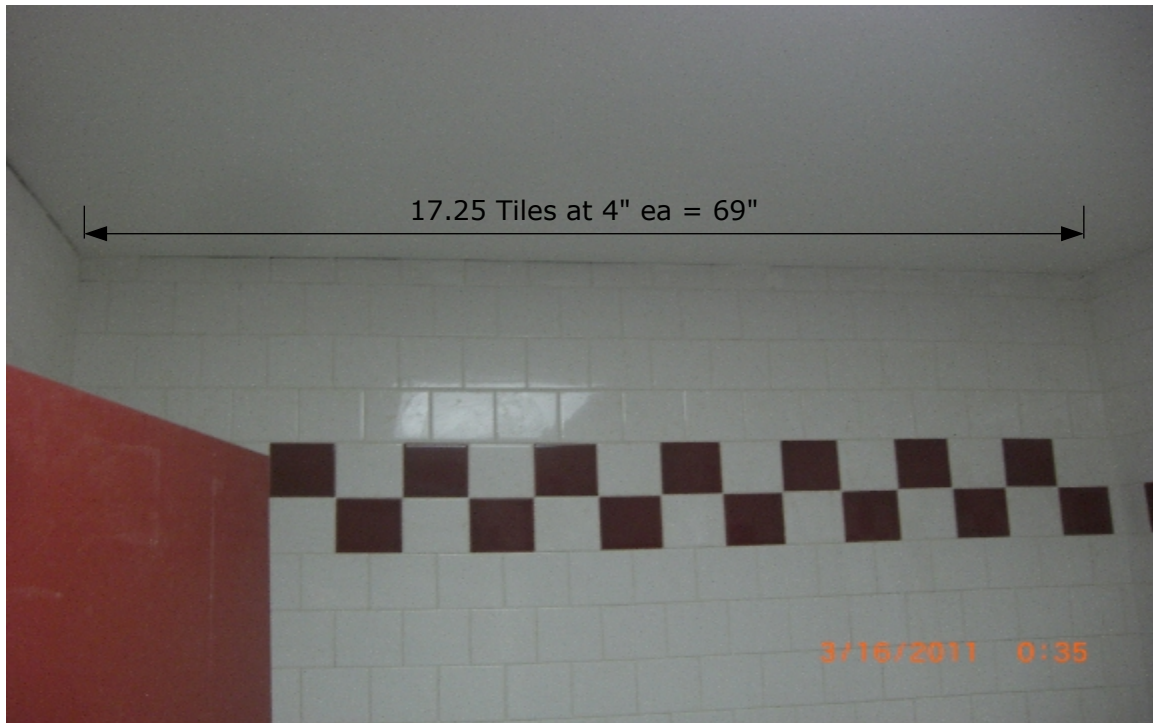
Photo of Existing Mens Room Showing Width based on Tile Count