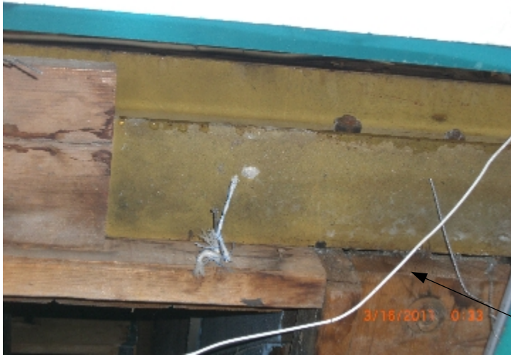
Junction of Main Exterior •Wall Beam Timber Roof Truss